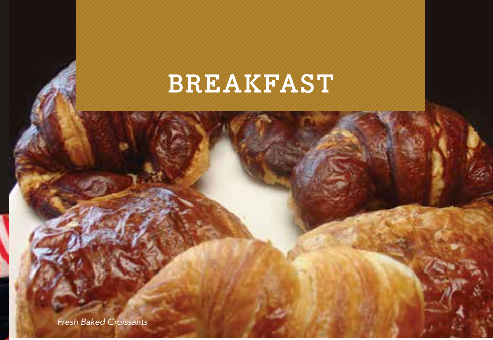
Fresh Baked Croissants