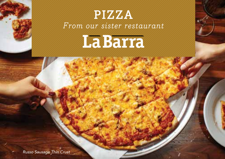
Russo Sausage Thin Crust