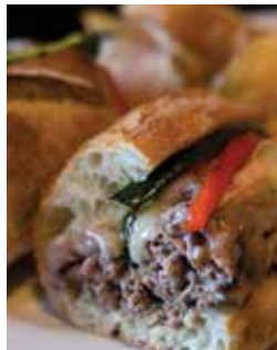
French Dip on French Baguette

Thinly sliced Boar's Head roast beef in natural au jus with shredded Grande mozzarella on our famous baguette. Hot Italian giardiniera available upon request.