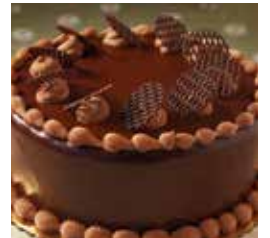
Freshly Baked 10" Cake

Apple, Pumpkin, Pecan and Chocolate Cream