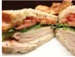
Turkey Sandwich on Multigrain

Sandwiches served with hand cut Parmesan Potato Chips.