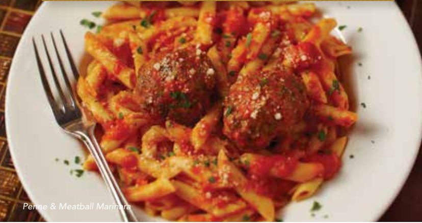
Penne & Meatball Marinara