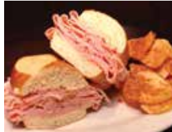
Ham Sandwich on Pretzel Bread